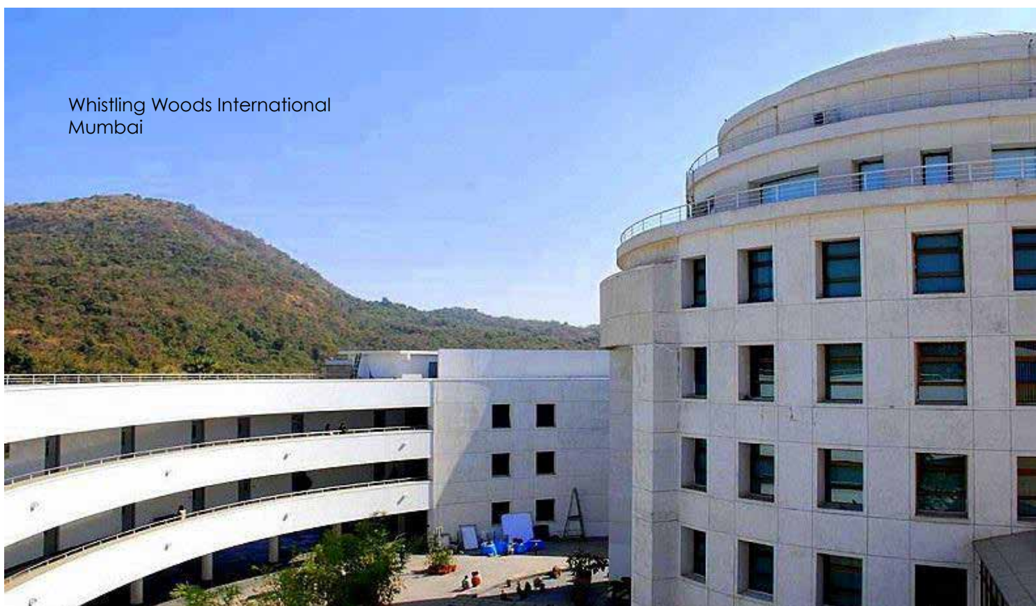
Whistling Woods International Mumbai