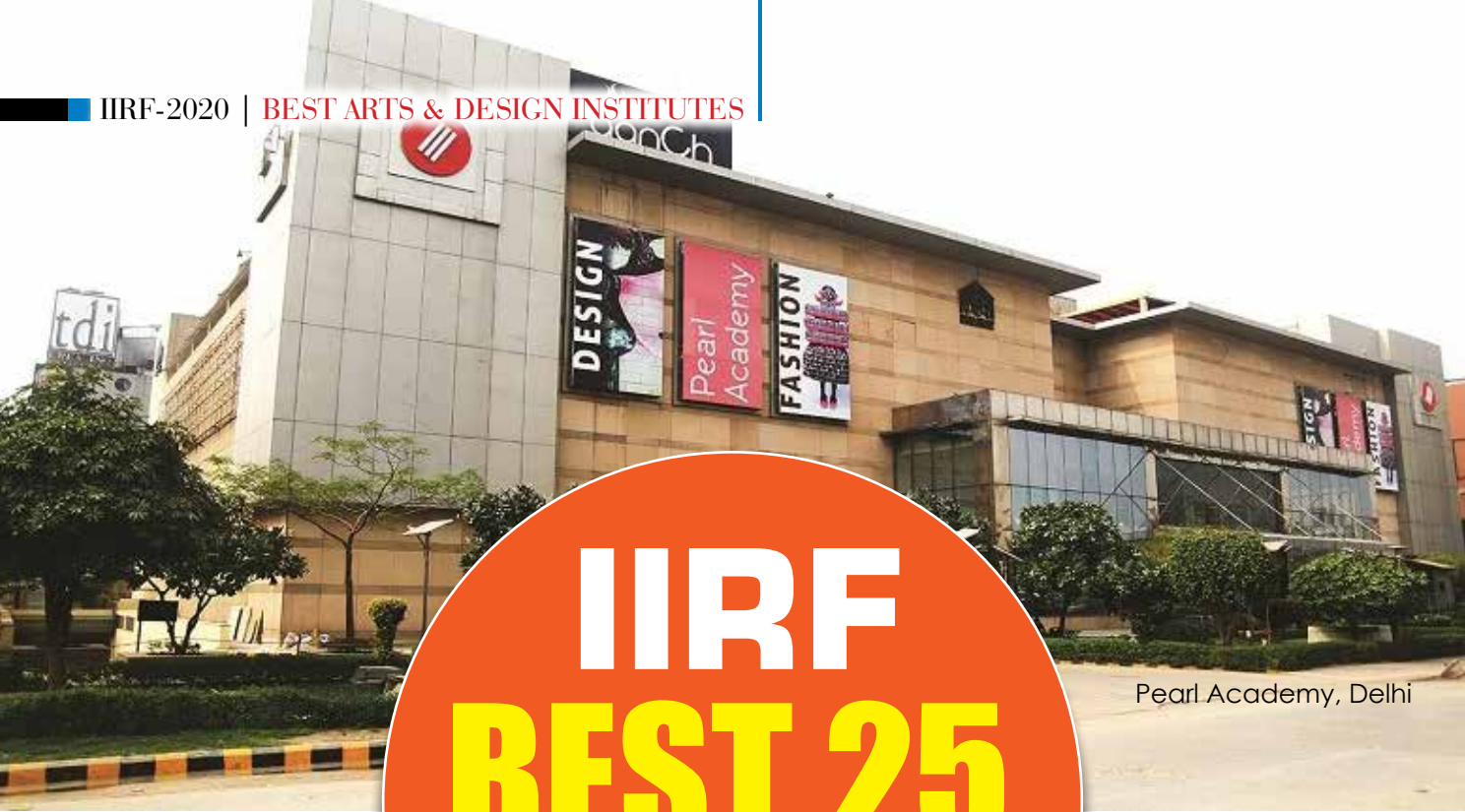
Pearl Academy, Delhi