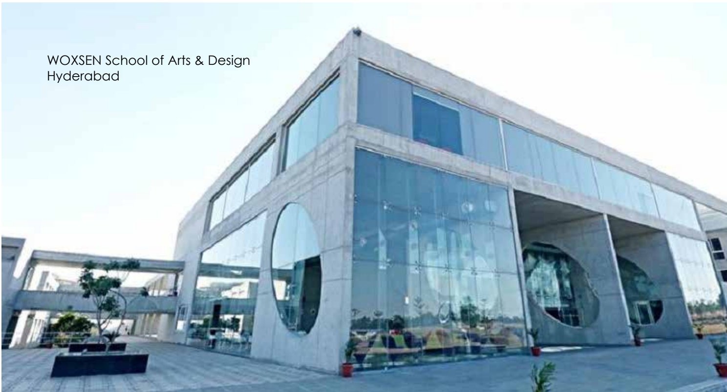
WOXSEN School of Arts & Design Hyderabad